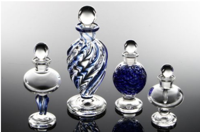
A series of perfume bottles by Reginald Thompson