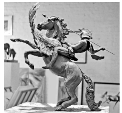
Maquette of Bellerophon astride Pegasus